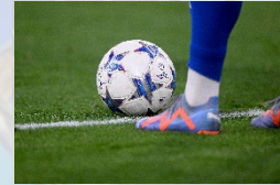
Kick-off first half